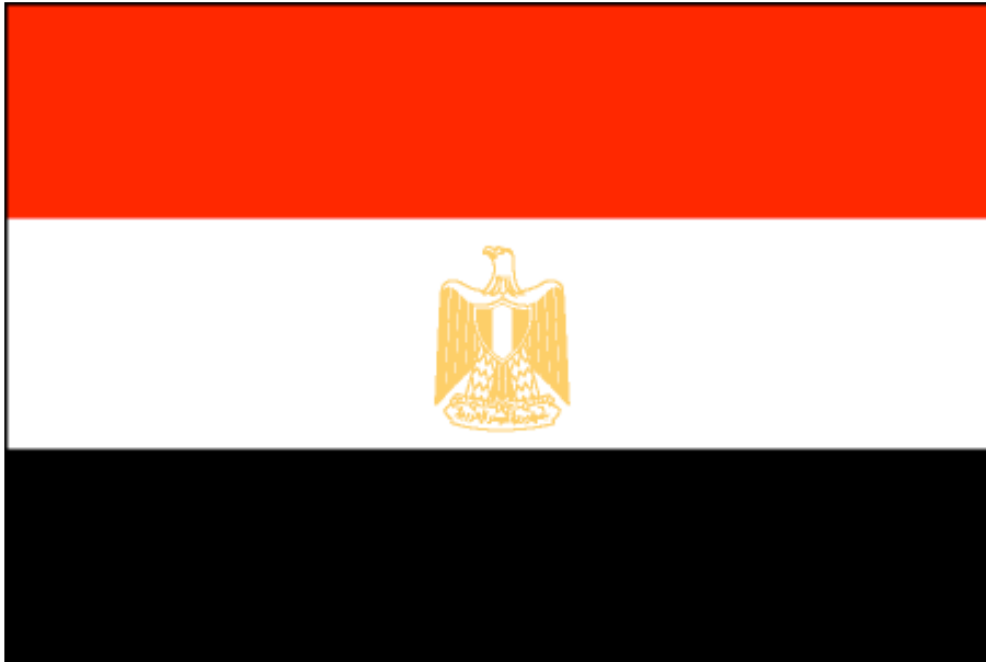
Flag of Egypt