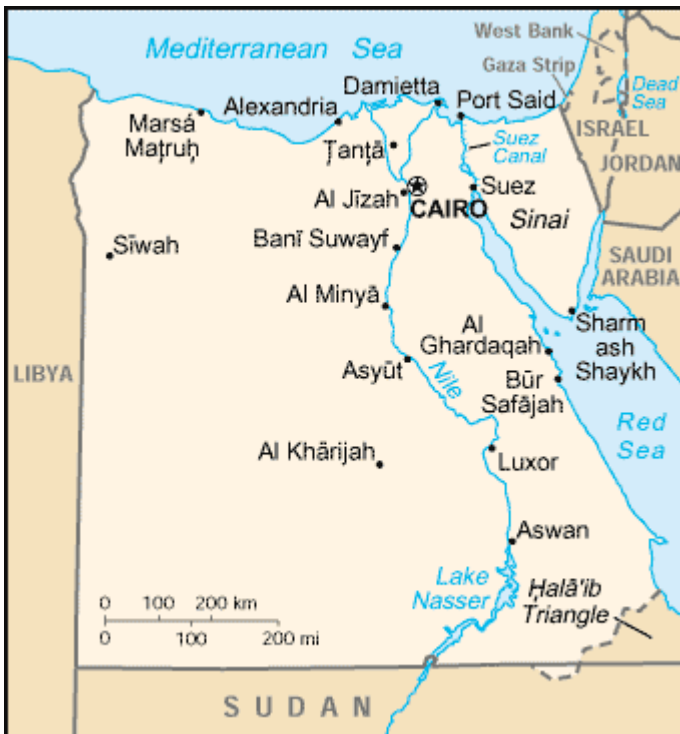
Map of Egypt