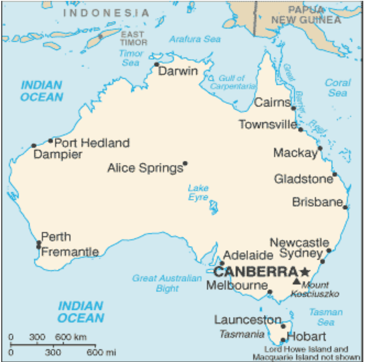
Map of Australia