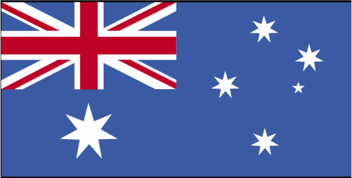
Flag of Australia